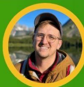
AJ Barrow Youth Ministry

BBQ'S AND BREAKFAST POOL AND WATERSLIDE CAMPFIRE AND SOCIAL TEEN, TWEEN, AND YOUNG ADULT PROGRAMMING SATURDAY NIGHT MASS TALENT SHOW