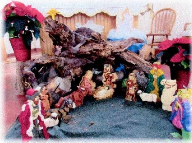
CHRISTMAS NOVENA PRAYER (December 16th to 24th)

You are invited to pray the Novena to the Infant Jesus for Christmas. You can view the invitation by going to the website: carmelspall.org . You will find the novena under Announcements and News Or CLICK THE FOLLOWING LINK TO OPEN PDF AND PRINT: http://carmelspall.org/wp-content/uploads/2024/12/Christmas-Novena.pdf