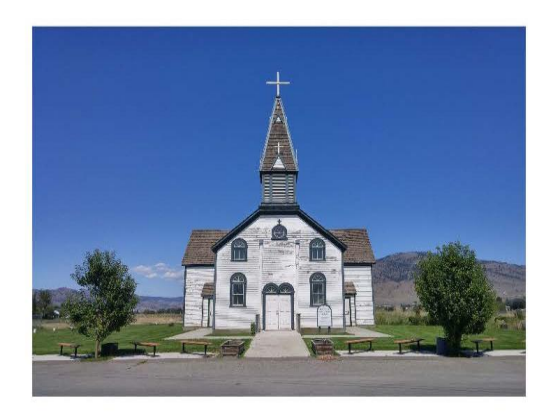
You Are Cordially Invited to commemorate the Anniversary of the Covenant Signing on Easter Sunday, April 20, 2025

Join us as we come together in faith, unity, and reflection.