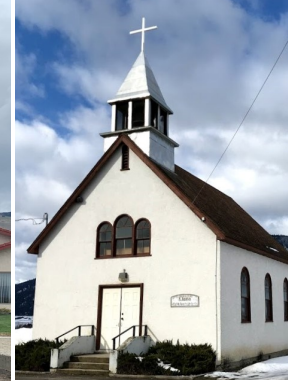
Mass Times 12:00 pm Sunday 1st, 3rd and 5th Sunday