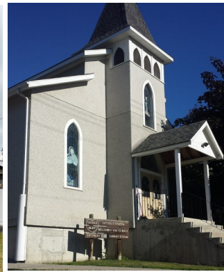
Mass Times 5:30 pm Saturday 9:30 am Sunday