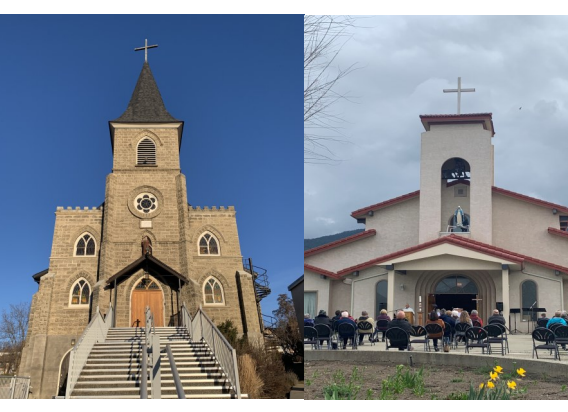
Mass Times 5:00 pm Saturday 8:30 am Sunday 7:00 pm Sunday

Sacred Heart Church 2202 Park Ave Lumby, BC V0E 2G0