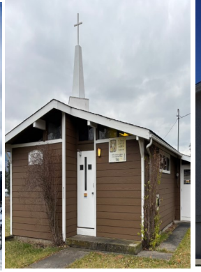
Mass Times 12:00 pm Sunday 2nd & 4th Sunday