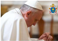
The Holy Father's Prayer Intentions entrusted to his Worldwide Prayer Network for the year 2024